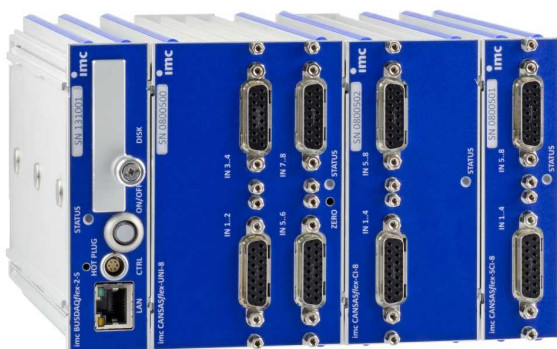
imc CANSASflex modules connected (click-mechanism) in a block with imc BUSDAQflex logger (left)