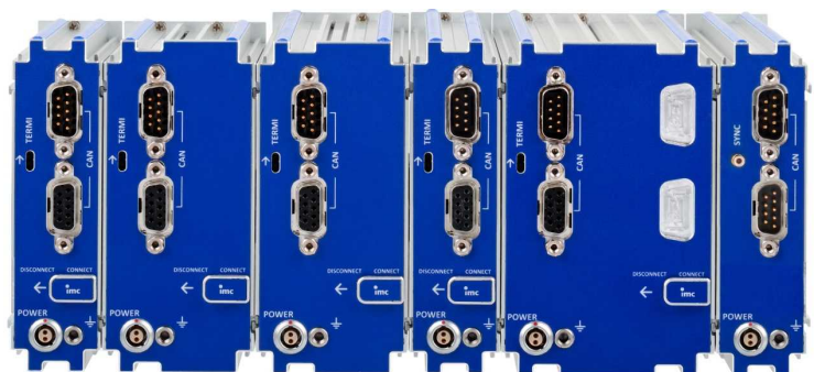
rear view of this block: CAN, power supply, terminator, locking slider