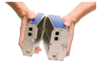
imc Click Mechanism

The imc Click Mechanism and extruded aluminum case provide a firm mechanical and electrical connection. As a result, no mainframe or rack is needed.