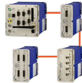
imc CRONOSflex distributed system