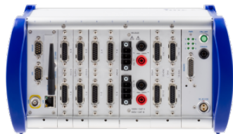
imc CRONOScompact portable housing