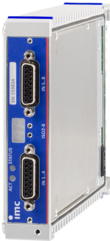
CRXT/ISOF-8 (Fig. similar)