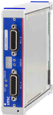
CRXT/HRENC-4 (Fig. similar)

When using two-track sine/cosine signal encoders, conversion to digital values for determining the rotation direction and the absolute count of increments (full periods) is performed. Additionally, detailed information about the position can be gained by analog evaluation of the sine/ cosine signal, which results in yet further increased resolution.