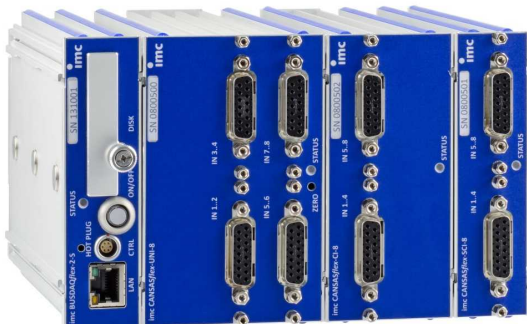
imc CANSASflex modules connected (Click-mechanism) in a block with imc BUSDAQflex Logger (left)