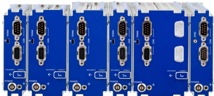
rear view of this block: CAN, Power supply, Terminator, Locking slider